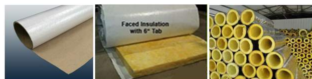
Reinforced Aluminium foil with White PP