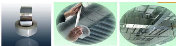
Aluminium foil fiberglass cloth tape