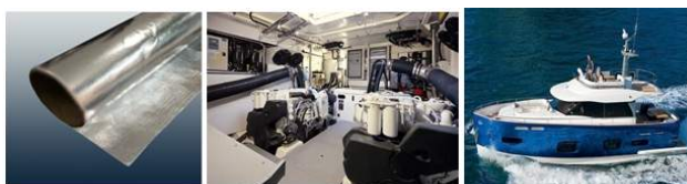
Double side aluminium foil fiberglass cloth