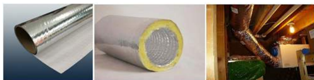
PVC reinforced aluminium foil

Product features include: Excellent reflection of both heat and light | Strong adhesion and holding power Good aging resistance | Low moisture vapor transmission rate.