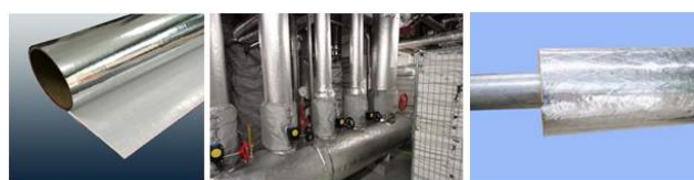
3 in 1 reinforced white PP Aluminium foil