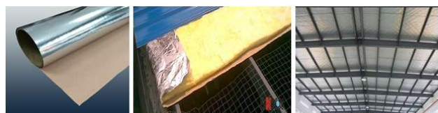
Aluminium foil facing