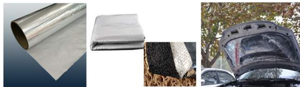
Aluminium foil mesh