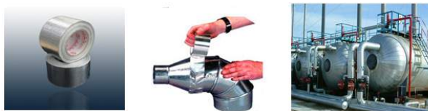
Aluminium foil mesh tape