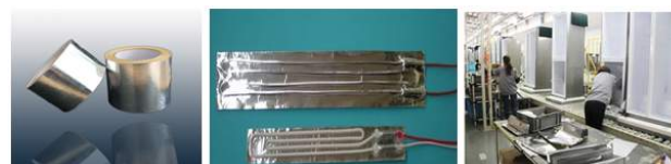
Aluminium foil tape