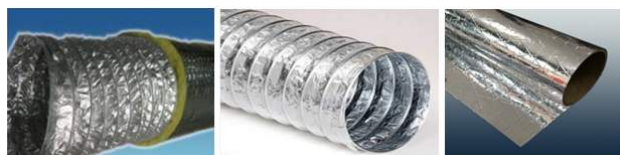
Double side reinforced aluminium foil