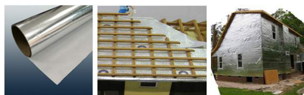
Aluminium foil fiberglass cloth